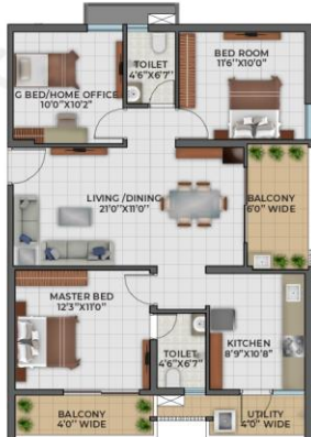
UNIT TYPE F 1428 SFT | WEST FACING | 3BHK