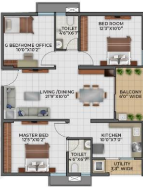
UNIT TYPE D 1273 SFT | WEST FACING | 3BHK