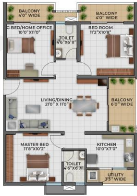
UNIT TYPE B 1428 SFT | WEST FACING | 3BHK